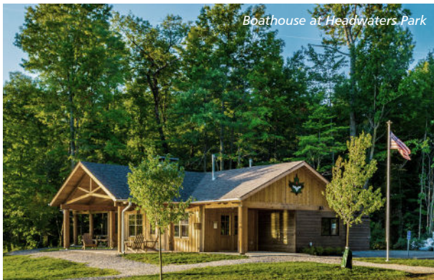
Boathouse at Headwaters Park

Lodges are enclosed spaces, and most have an open patio area. All lodges have fireplaces and nearby restrooms. Heat is on during cold weather months.