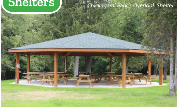
Chickagami Park's Overlook Shelter

Shelters are open air and can be reserved year-round. They have picnic tables and electricity. Most have nearby restrooms. There is no heat available.