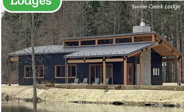
Swine Creek Lodge

Lodges are enclosed spaces, and most have an open patio area. All lodges have fireplaces and nearby restrooms. Heat is on during cold weather months.